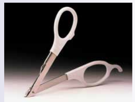
SR-3 (scissors-style staple remover)