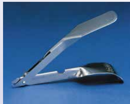
SR-1 (tweezers-style staple remover)

Simple to Remove —Squeeze, lift and remove.